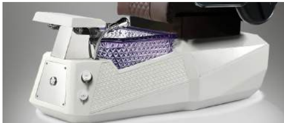
WHITE BASE & BLACK NICKEL BOWL