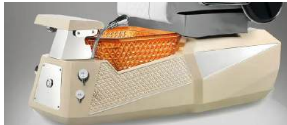
BONE BASE & GOLD BOWL