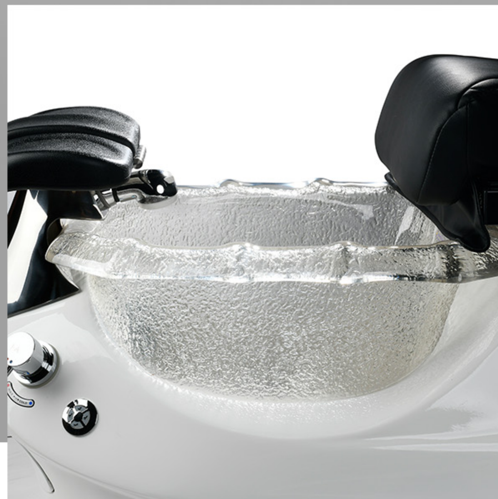
White Base/Crystal Bowl