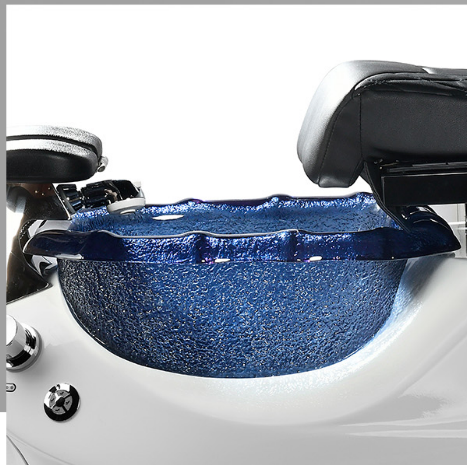
White Base/Dark Blue Bowl

*Due to differences in monitor or print settings, there may be a slight difference in color between what is shown on the site/catalogue and the final product. If you would like to see the product in person, please contact us so we can direct you to the nearest distributor showroom to see a sample.