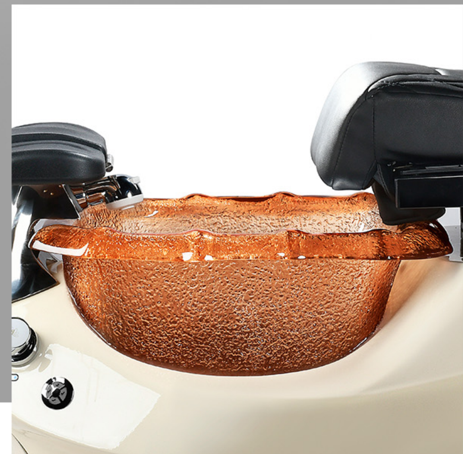
Bone Base/Gold Bowl